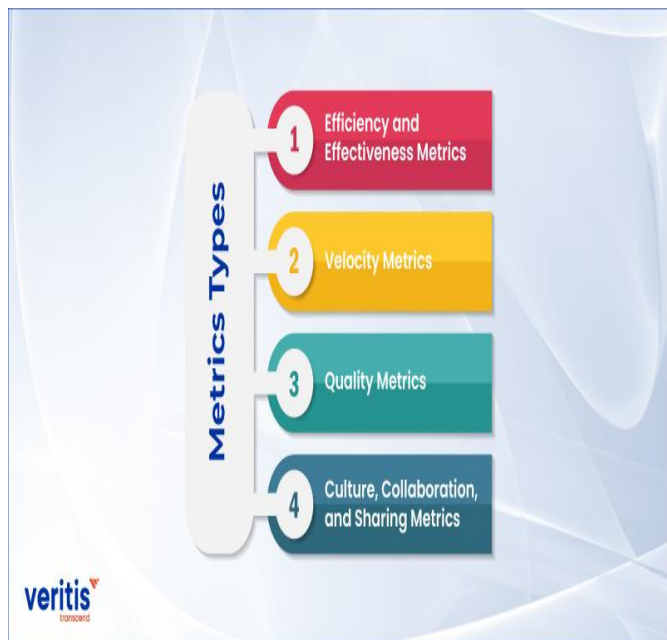
Fig.2 DevOps Success,source([2])

However, measuring DevOps success remains challenging. Organizations must rely on well-defined KPIs to assess efficiency, identify bottlenecks, and enhance performance. This paper explores the most effective KPIs for evaluating DevOps success and proposes a structured methodology for their measurement.